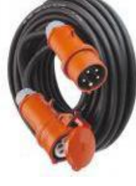
32 A CEE connection